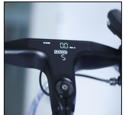
JUST 1 KINGMETER